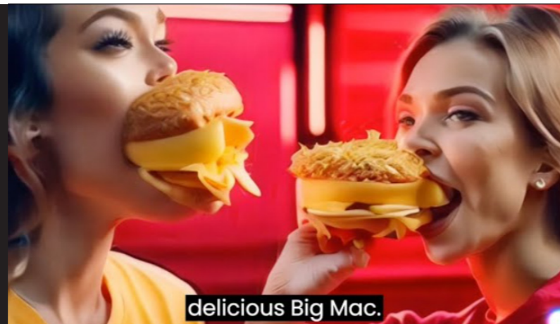
Screenshot from 'McDonald's AI Generated Commercial'

For now, some instances of machine creativity - where these extend beyond the exploratory and veer into the exploratory and transformative, are evidently quite dark and elicit surprise of the unpleasant and not the 'impossibilist' kind. One does not have to watch all TikToks in the known social media-verse to detect a troubling trend: when asked to generate a McDonalds commercial, for example, AI creates a nightmarish pastiche of monstrously twisted human characters frantically consuming burgers, set to a voice-over track that (most likely unintentionally) parodies a cacophony of influencer voices.