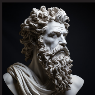
Statue of Plato

Considering that the ChatGPTs and the Midjourneys and the Stable Diffusions of the world are already plucking ideas from the original realm (so to speak) and making artistically designed or written copies thereof, are these large language and diffusion models making mere copies of 'what is'? Or are they making copies of 'what should be'? Or are humans the only sentient copycats who can portray what should be, for now?