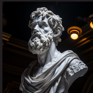
Statue of Aristotle

Whereas Greek philosopher Plato regards art or poetry (and by extension, respectively, visual design and creative writing or copywriting, in the Red & Yellow context) as thrice removed from the ultimate original realm of ideas (in Plato's mind, a realm dreamt up by a deified intelligence), and therefore as false mimicry and entirely devoid of meaning, Aristotle argues that mimesis - in our context, visual design, creative writing, copywriting - does not merely represent copies of the realm of ideas as they are, but also as they should be.